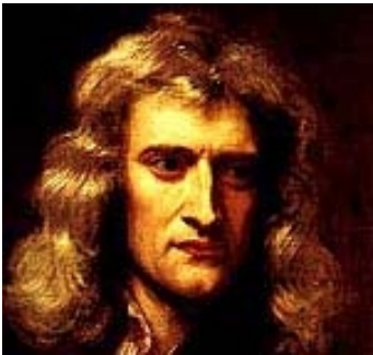
Sir Issac Newton Scientist and Mathematician 1643 - 1727