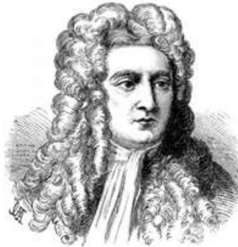
Sir Isaac Newton

Jan. 4 Sir Isaac Newton was an English physicist, mathematician, and philosopher. He wrote one of the most influential works on physics of all times. In The Principia , Newton used math equations to explain how objects moved. His calculations changed the way people looked at the universe.