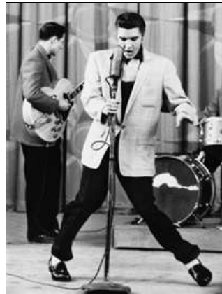
Elvis Presley in 1956

Jan 8. To calculate Elvis Presley’s age in a specific year, subtract the year of his birth from the year in question ( 1956 - 1935 = 21 ) for an answer of 21 years old. Elvis had many hits in 1956, including “Heartbreak Hotel,” “Hound Dog,” and “All Shook Up,” which was included in Rolling Stone Magazine’s list of the 500 greatest songs of all time.